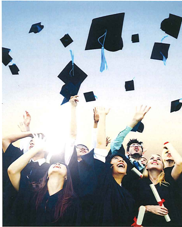
Office of Vocational Rehabilitation

If you are interested in learning more about these services, please contact your OVR liaison to schedule an informational meeting. OVR is looking forward to collaborating with you and to providing your students with some great opportunities!